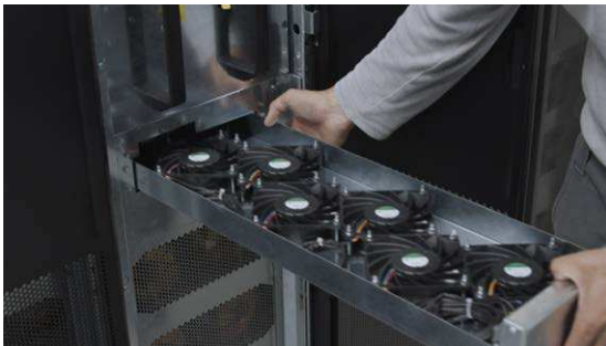
N+1, fault-monitored fan assembly housed in cable-free slide-out drawer for maximum reliability and easiest maintenance.

For flexibility and additional resilience, each DPA™ module can be fed from an independent or common battery system