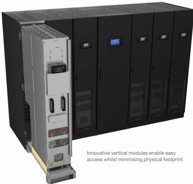
Innovative vertical modules enable easy access whilst minimising physical footprint.

That protection is achieved with best-in-market 97.4% VFI energy efficiency, reducing environmental impact, optimising PUE measures and delivering significant financial savings in energy and cooling costs.