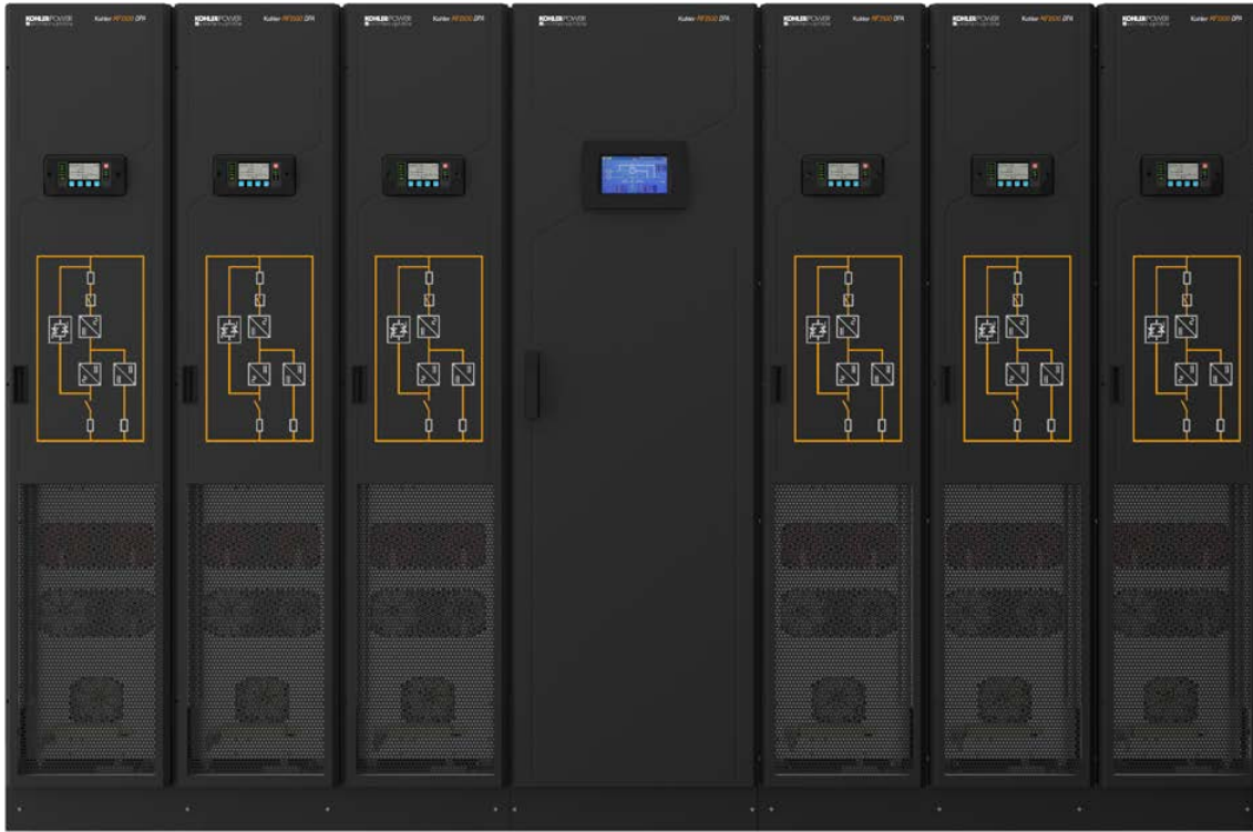
A 1.5MW MF1500 DPA with a central connections cabinet flanked by six 250kW modules, each containing all elements of a UPS.